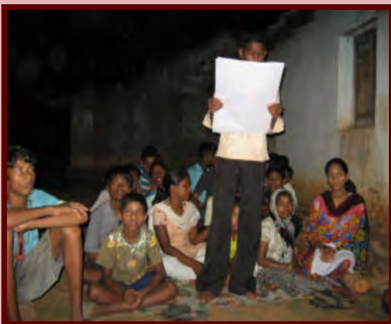
A child reading out his demands in Kudpakia Village