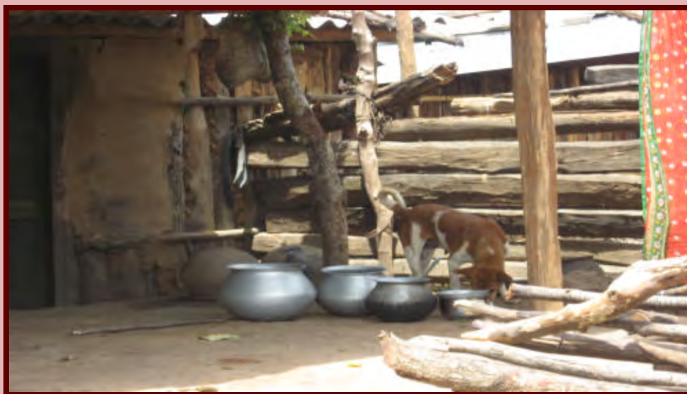
A dog finds its way to the open kitchen

Programme (SNP) till March 2010, officials admit malnutrition levels remain high. For instance, table 4 shows how the number of children in grade III and grade IV, the worst health conditions, has consistently risen in the last three years and has been the highest in this period. More important, the number of children in the 0-3 years' age group being covered under SNP was found to drop sharply in 2009 from what it was in 2008.