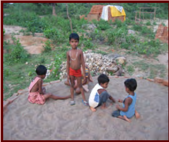
Children play next to the tents in Nandagiri

In the tsunami of 2004, one-third of the affected in India were children. In the 2001 Gujarat earthquake, 2.5 million children lost their homes and schools, says UNICEF. But there is a somewhat greater acceptance of a natural disaster, while armed conflict, ethnic or religious violence is created by humans and involves decisions that are forced