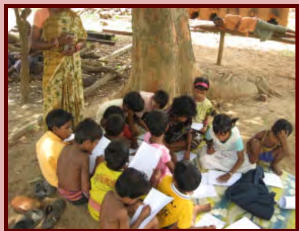
Little ones in Gunjibari Village want to show their talent