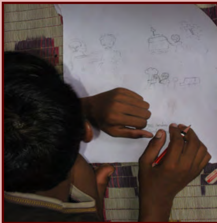
A boy putting his thoughts on paper