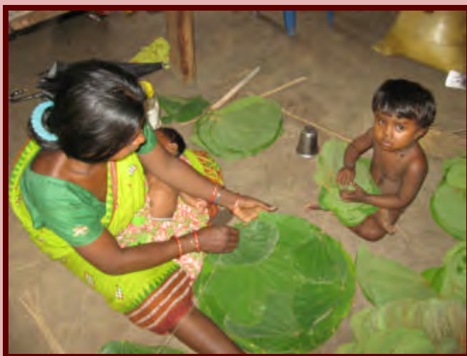
A child helps her mother make sial leaf plates

The people of Kandhamal were poor even before the violence, with most families working as farm wage labourers, and a few as farmers growing paddy on tiny bits of land. Like all people of the forests, they collected minor forest produce, such as firewood and sal and sial leaves to make plates, either for their own use or to sell for a pittance. In this, they were helped by the children. Even such meagre livelihoods were badly affected