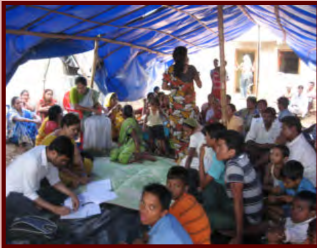
The team interacts with children in Bakingia Village

enriched by on-the-spot assessments of the situation as well as of the daily lives of the victims, especially the frank and candid discussions with Kandhamal's children. Their feelings and opinions have been recorded in detail for the first time here.