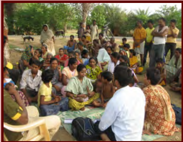
Another meeting in progress in Pirigada Village

The team used drawing, writing and open discussions to capture the feelings of the children. A big positive among the children was that most of them used their religious belief and faith as a means to cope and forgive, a fact that showed up in their repeated use of the cross in drawings. Yet, this heightened sense of religious identity, fanned by the violence, may be counter-productive in the long run and may also keep them from letting up and discussing their deep feelings.