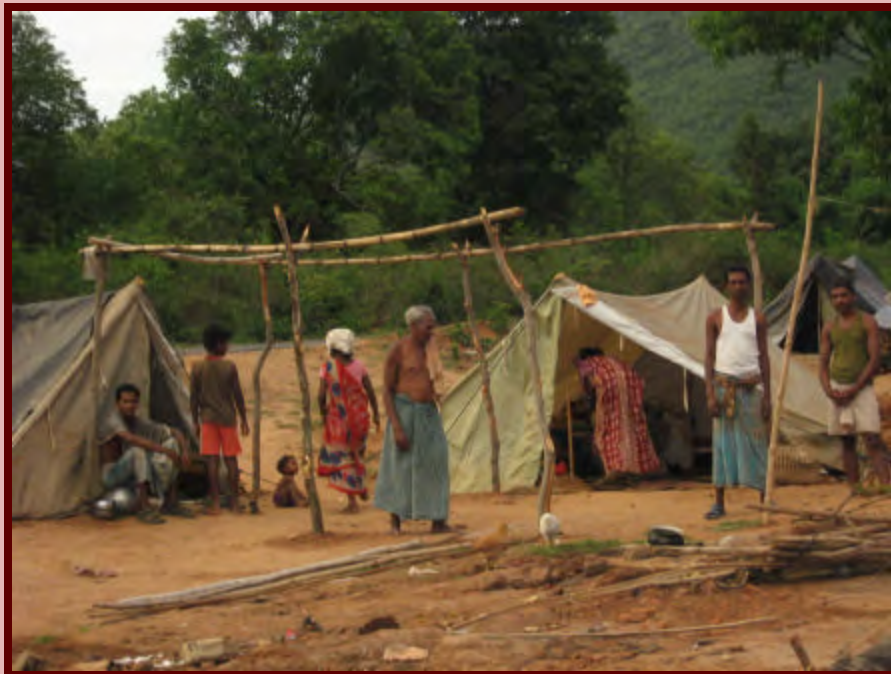
People somehow managing in the tiny tents, Anandnagar

Even two years later, the security of the people remains the main concern, along with a sense of miscarriage of justice. Witnesses are coerced, threatened, cajoled and sought to be bribed by the people facing trial for murder and arson. Matters have been made worse by inadequate police investigation and a silent administration. Needless to say, the most important finding of the study team is the sense of injustice, discrimination and fear prevailing among children, threatening to severely impact their growth and development.