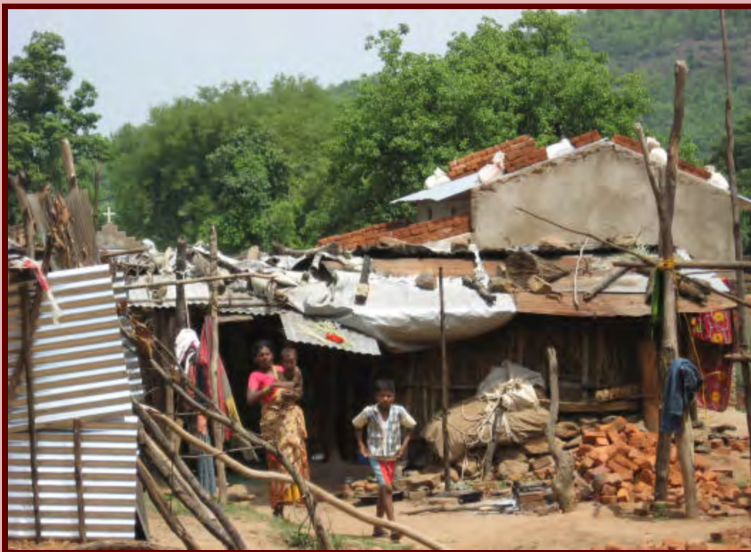
People still staying in tents in Nandagiri

The people of Kandhamal, Orissa, and neighbouring areas bore the brunt of two violent anti-Christian communal attacks within the span of 12 months over 2007- 08, leaving over 55,000 people displaced and several injured with no shelter, security or livelihood. Today, after two years, the situation shows little improvement, although the administration claims it is peaceful and has returned to normal. Children, as always is the case in such situations, are the most vulnerable and voiceless. To create pressure on the Government of India and to secure justice and all other human rights for the affected people of Kandhamal, 56 civil society organisations have come together under the National Solidarity Forum. The Forum has three major objectives: making an assessment of the situation on the ground; organising a People's Tribunal over 22-24 August 2010 in New Delhi to hear testimonies of survivors, witnesses, victims, human rights activists, civil society organisations, experts, government representatives and local organisations; and finally, demanding immediate action from the government. This report by HAQ: Centre for Child Rights seeks to put the spotlight on the status of the children in the affected areas, highlighting their trauma over the violent past, worries over an uncertain present, and concerns of a hopeless future.